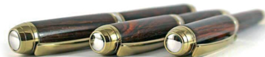
Accent cabochons correctly fitted on a collection of Beaufort Mistral pen kits

It goes without saying that the plating on the parts that will ultimately remain visible is tightly controlled. The need to occasionally ream out the hole or introduce glue to the proceedings is not a reflection on the quality of our pen kits, it is just that the parts that will not be seen are used logistically to facilitate the plating of the parts that will be seen, and therefore cannot be controlled quite so tightly. We could easily factory fit all the accents in order to prevent these issues from ever arising, but that would also serve to reduce the choices we are able to offer. We hope you agree that the occasional spot of glue or use of a hand held drill bit, both of which are the work of seconds, is a price worth paying for the quality and choices we are able to offer.